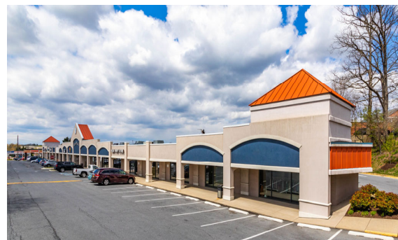
Pre-Renovation images, fronting E. Gude Drive